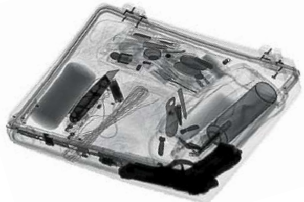
Black & white image: High-quality image for recognition of threat objects (gun, knives, etc.)