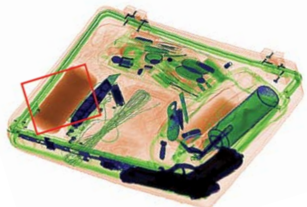
Optional ADS software (red outline)