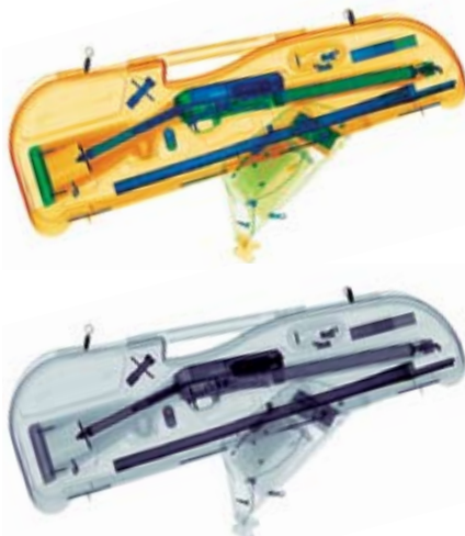
Example of the excellent image quality obtained by FEP ME 640 DEXGIL. The materials are shown with the following colorations: orange for organic, blue for metals and green for amorphous materials.