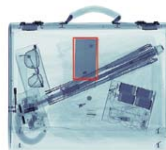
Example of DEXGIL automatic explosive alert in an apparently innocuous luggage