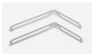
Mounting bracket long (optional)

Allows greater tilt of the sound column; Dimensions: 18.5 x 13.5 cm