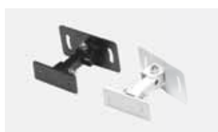
Swing & tilt mounting (optional)

Allows greater tilt of the sound column; Dimensions: 18.5 x 13.5 cm