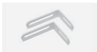
Mounting bracket standard (short)