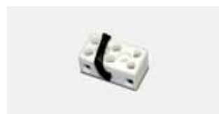
Ceramic terminal (optional)

Connection terminal covered by metal plate (Ceramic Terminal + thermal fuse) incl. cable entry clamp with stress relief