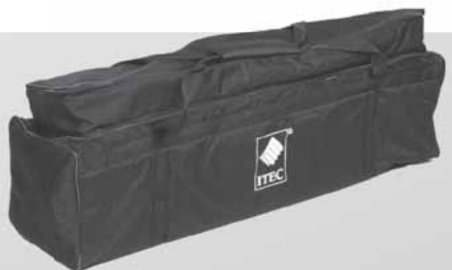
Handy transport bag for Active-Box, stand and accessories

Integrated CD/MP3/USB-Player, simple operation